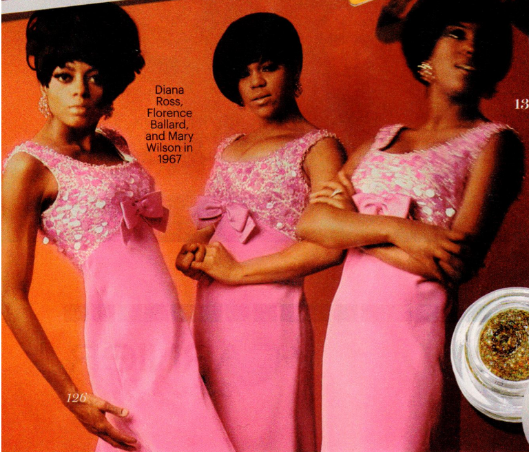
Diana Ross, Florence Ballard, and Mary Wilson in 1967