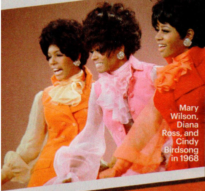
Mary Wilson, Diana Ross, and Cindy Birdsong in 1968