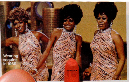
Wearing sequins in 1969